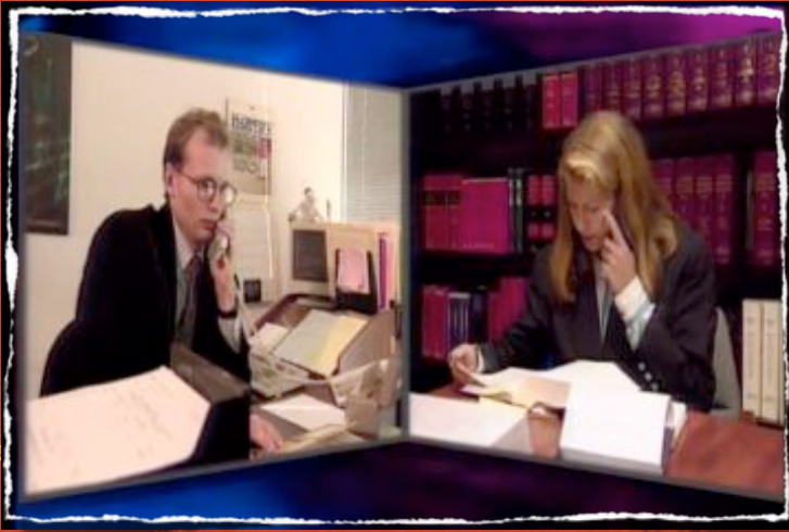
THE FAIRER SEX