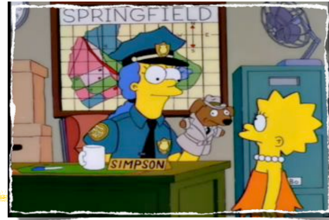
LISA PRESENTS THE CONFLICT THEORY PERSPECTIVE ON THE CRIMINAL JUSTICE SYSTEM