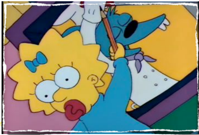
SOCIALIZATION BY VIOLENT TELEVISION