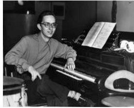
Howard S. Becker, c. 1950 (above) and today (below)