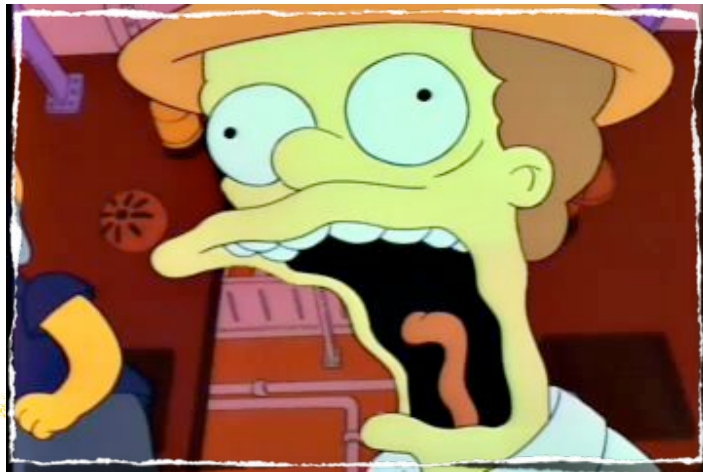
MELTDOWN AT SPRINGFIELD NUCLEAR POWER PLANT