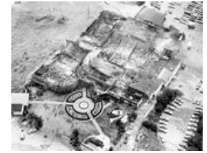
Beverly Hills Supper Club fire photos