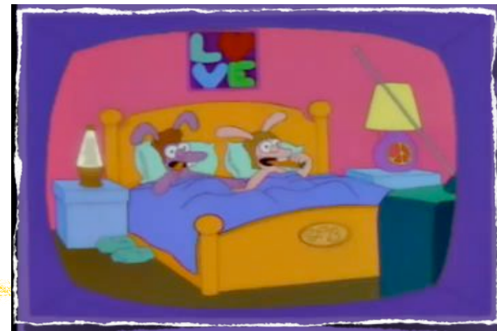
FUZZY BUNNY'S GUIDE TO YOU-KNOW-WHAT