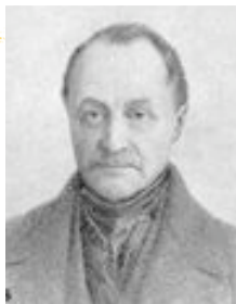
Auguste Comte (1798-1857)